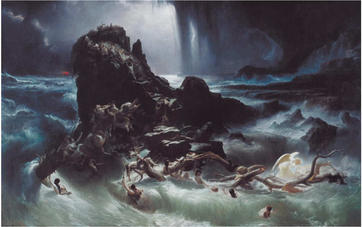
The Deluge , by Francis Danby, 1840. Oil on canvas.